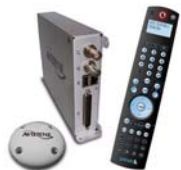
MLB700 Sirius® Broadcast Datalink Receiver

Adds Two-Way Text Messaging when interfaced with MLX770.